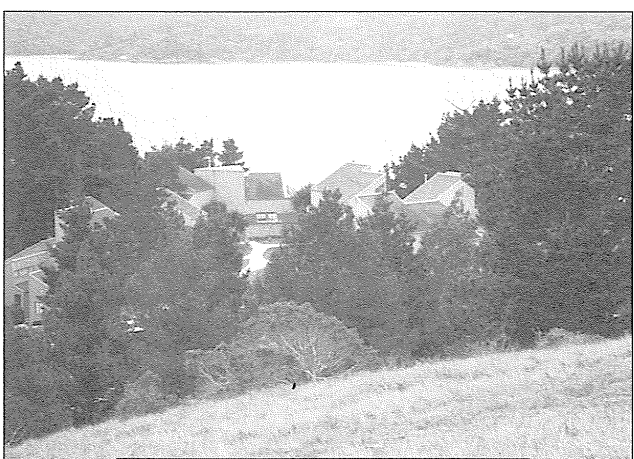
Marconi Conference Center's guestrooms overlook Tomales Bay

We hope that between highly productive meetings you'll have some time to appreciate the rich human and natural history that surrounds us here. Please let us know if there is anything we can do to enhance your stay.